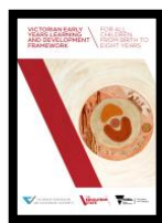
Victorian Early Years Learning and Development Framework

Approved learning framework: A document that outlines practices that educators and co-ordinators must use to support and promote children’s learning. The Early Years Learning Framework (Belonging, Being & Becoming) , the Victorian Early Years Learning and Development Framework and My Time, Our Place; Framework for School Age Care in Australia are approved learning frameworks for use in Victoria ( refer to Sources ).