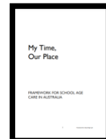
My Time, Our Place; Framework for School Age Care in Australia